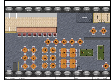
Floor Plan Screen