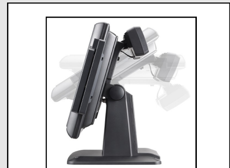
POS-BREEZE Tilt angles