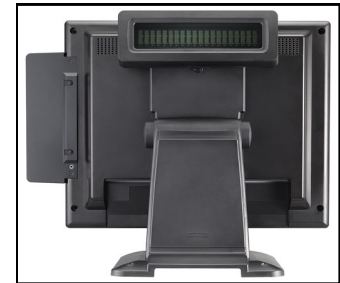
Customer Display (optional)